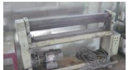
Powered Slip Roll