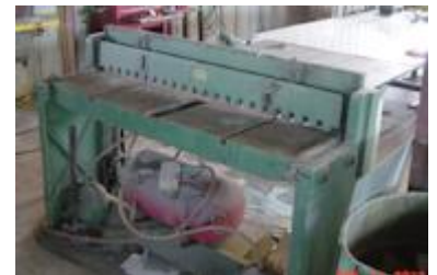
Air operated cut-off shear